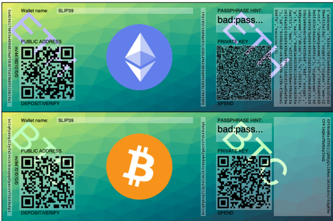
Figure 2: Paper Wallets (from --secret ffff... )